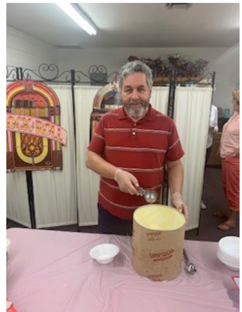
Pie Social