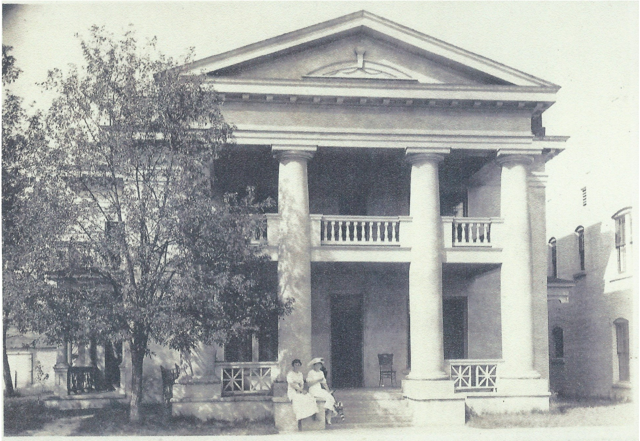
This structure was in Grants Pass on E Street. Can you name it? (4th and last question.)

Since the last newsletter we have had three groups of young volunteers who have come to the Historical Society grounds to spruce up the place. The first was Project Youth and about a dozen teenagers came with their advisor and they pulled weeds, cut branches, swept the sidewalks and parking lot and filled all the garbage cans and debris cans to the brims. They covered the Research Library and Schmidt House. A couple weeks later a group of single young adults from the Church of Latter Day Saints removed all vegetation debris from the Schmidt House Gardens the Monday before the Pie Social. Previously, another church group came to remove the Spring debris from the Library grounds. We thank these groups who actively look for non-profits they can help. We thank these unexpected volunteers.